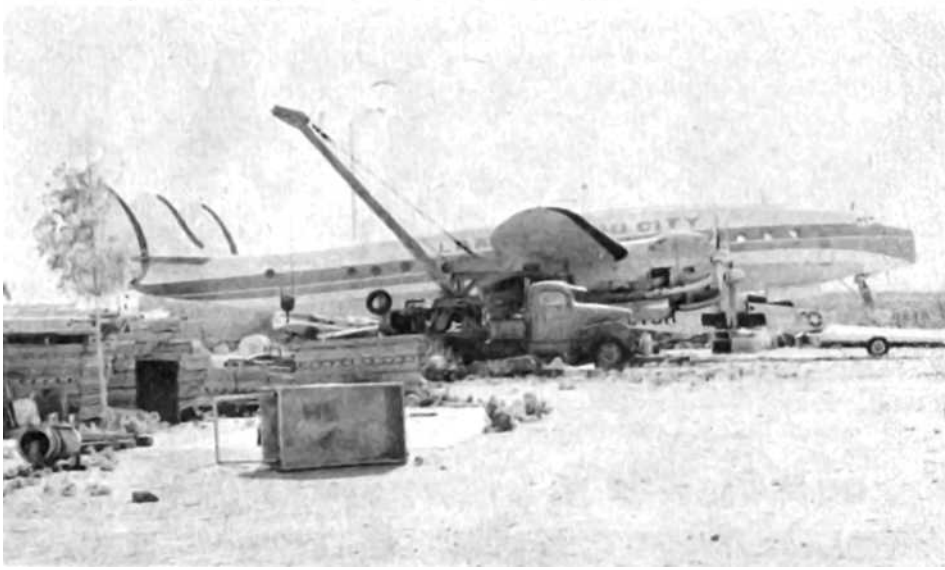
No sign of the Connie's past history was visible before restoration work began two years ago.