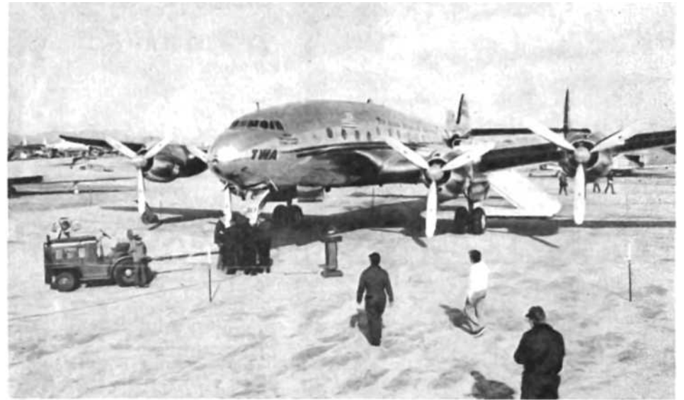
"Star of Switzerland" was returned to its original TWA markings by corps of dedicated volunteers.